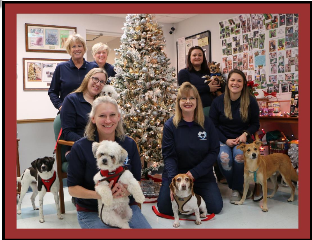
Briggs Animal Care & Adoption Services Staff

The BAAC's sister organization, Peace Plantation Animal Sanctuary, became operational in 1950. It ceased operations in 2014, and all of NHES' hands-on animal care services were absorbed by BAAC. Since 1950 through June 30, 2019, these two facilities have rescued, rehabilitated and placed 37,616 cats and dogs in permanent loving homes in 15 states and Washington, D.C.