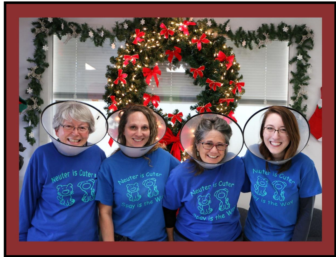
Spay Today Staff Having Some Fun

Since its creation in 1994 with one part-time employee and two participating veterinarians, Spay Today has grown to include a staff of four employees, one volunteer and 24 participating veterinary clinics and through June 30, 2019, provided 73,304 spay/neuter procedures.